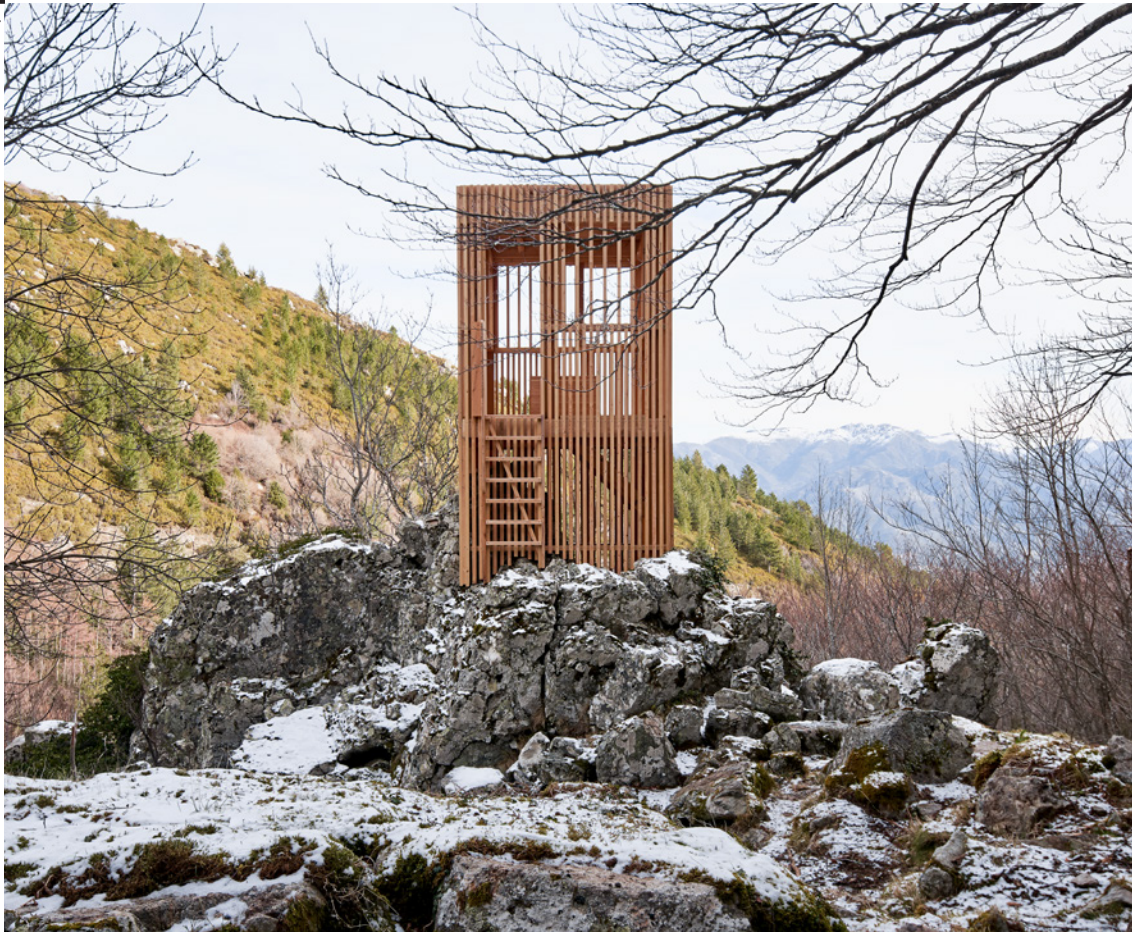
Figs. 2-4 The three observatories.