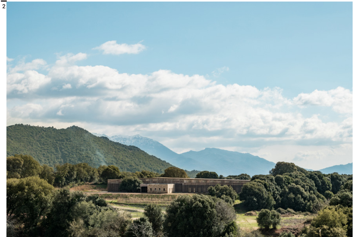
Figs. 1-2 Integration into the landscape.

to its gently sloping double pitch, contrasting the verticality of the surrounding mountains with its horizontality. The wooden cladding of the oblong volume of the building is punctuated by granite portions, with ashlar from the dismantling of other local buildings. The choice of the wooden structure is dictated by the potential this material offers in terms of space for a functional program such as a school.