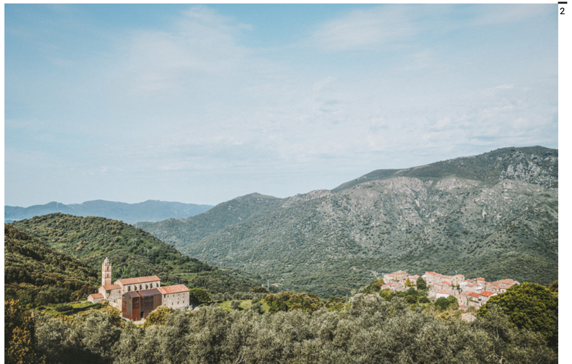
Fig. 1 The relationship with pre-existence.

original volumes and house the House of the Territory. The new construction intervention is reversible and can be dismantled so that in the future the building can once again become a ruin. The copper cladding also helps to enhance the light that strikes the building, reflecting and refracting it as opposed to the massive existing granite walls. In this way, the cladding transforms the place into an experience.