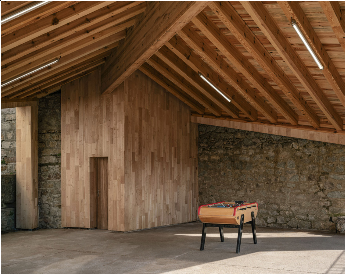
Fig. 3 General view.