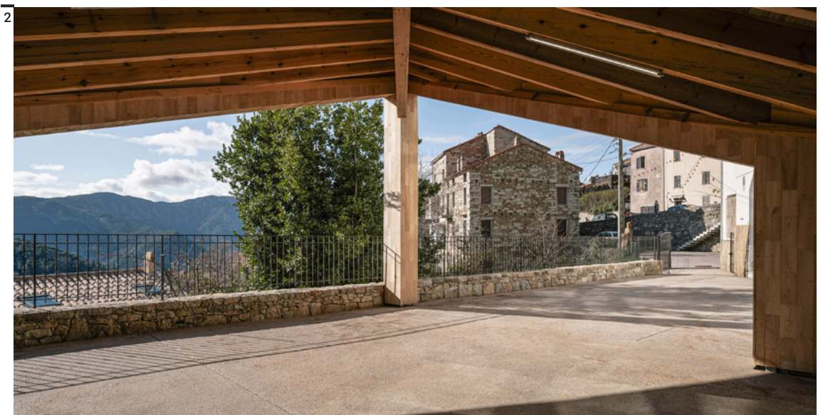
Fig. 1 Design axonometry.

The canopy is imagined as a homogeneous mass cut according to the site’s situations and constraints. Leaning against a dividing wall, it follows the strict limits of the site, but adapts to various situations. Indeed, its geometry stretches vertically to the West, opening towards the courtyard and the landscape view, and then lowers to the north not to obscure the light in the existing building. The particularity of the project is based on the desire to build the canopy using exclusively local wood resources within a radius of 30 km. The realization of this project is based on the reintegration of craftsmanship into architecture, allowing for a “tailor-made” design.